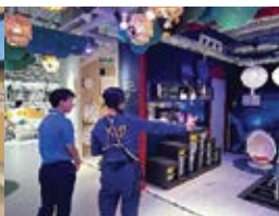
Quest for an Inclusive and Environmentally Sustainable World – Work Attachment and Learning Journey to IKEA