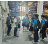
Quest for an Environmentally Sustainable World – Work Attachment and Learning Journey to The Polyolefin Company