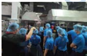
Quest for a Healthy World – Learning Journey to Elsie's Kitchen