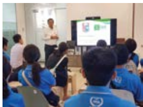
Quest for a Safe World – Learning Journey to Equip Medical Pte Ltd, one of South-East Asia's most prominent medical and baby care distribution companies